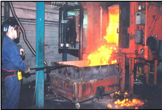
State of the art coal carbonization research and testing facility