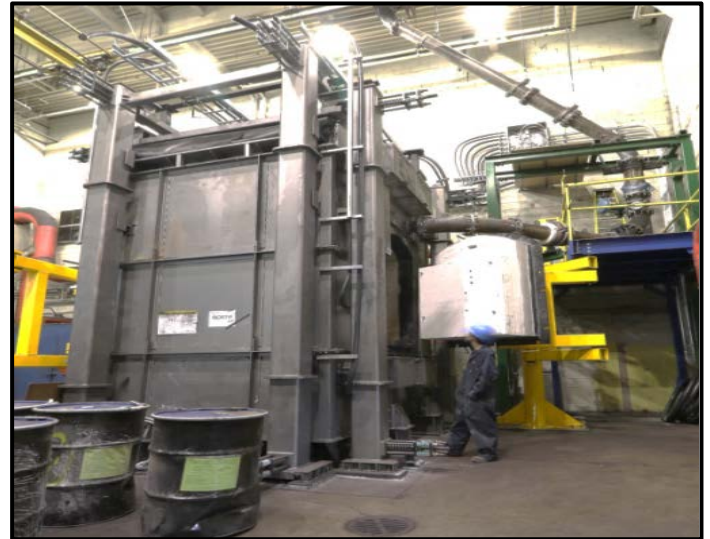
New 1-tonne capacity Energy Recovery Coke Oven

CE-O's metallurgical fuels facilities include pilot-scale coal handling facilities, coke ovens and coke testing facilities, a high-temperature smelting and laboratory coal and coke evaluation equipment. Most recently, a pilot-scale energy recovery coke oven has been added to the suite of CE-O pilot ovens.